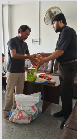
Food distributed among families of workers