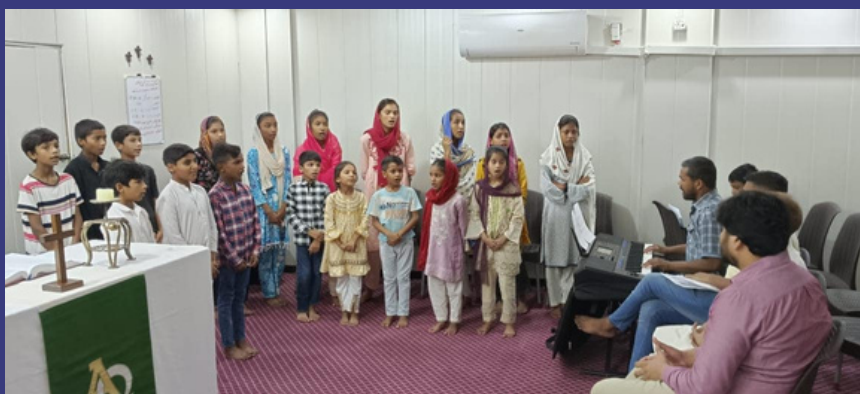
The children gather for hymn and liturgy practice every Friday

We believe that this hymnal will be revolutionary in advancing Lutheran Worship in Pakistan. The children in Concordia Lutheran School have performed Divine Service III for visiting Pentecostal pastors, some of whom now want Lutheran seminary training. The singing of God's Word has a unique way of imprinting the faith on hearts and minds!