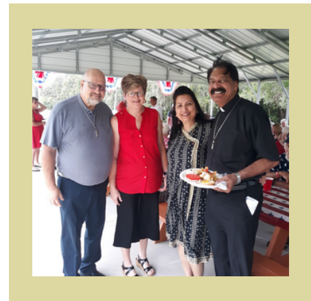
Christ Lutheran Church - Brooksville, FL