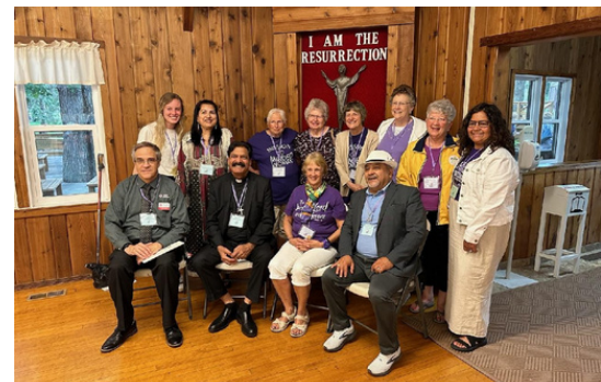
Iowa West District Convention - Lutheran Women in Mission