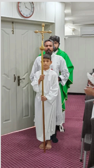
Worship at St. Mark's