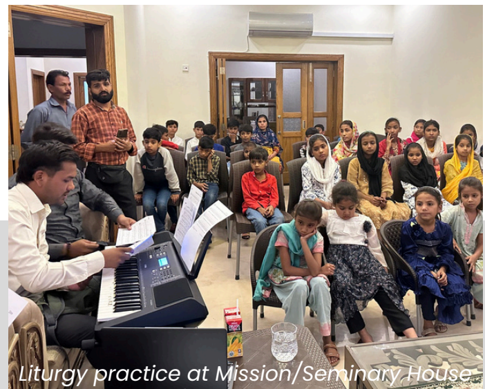
Liturgy practice at Mission/Seminary House