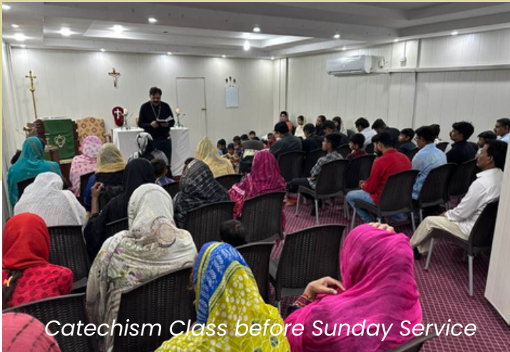
Catechism Class before Sunday Service