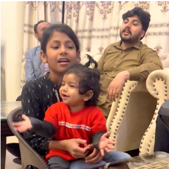
Even the children are learning to sing the liturgy!

They will each show only the melody line of music that will have a letter label above each note to facilitate accompaniment. This is a time-consuming process in making sure that the true and accurate theological meaning is conveyed, that the music connection makes sense, and there is a nod to holy, respectful poetic phraseology. It requires regular sessions (“Music Mondays”) in which our team practices singing the new music and lyrics in order to make the adjustments needed. We are currently about 90% complete with the Roman Urdu version, after which we will work on the Urdu script version, using music software that will allow the music notation of the melody line to be shown in a right-to-left format.